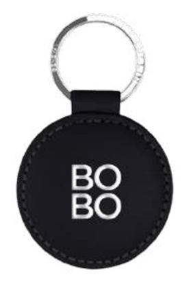
Driver €300 daily limit at gas station