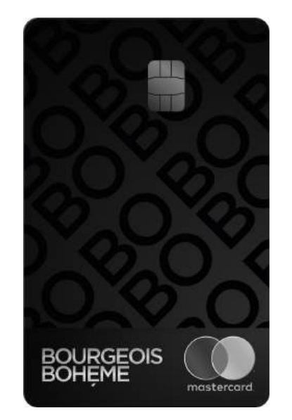
Wife No restrictions, auto top-up