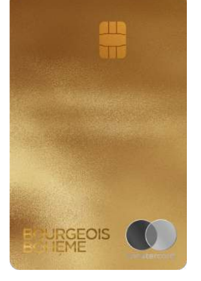
Husband No restrictions